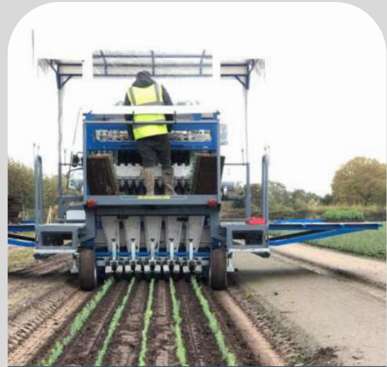
Forestry tree planting 5-line one robot