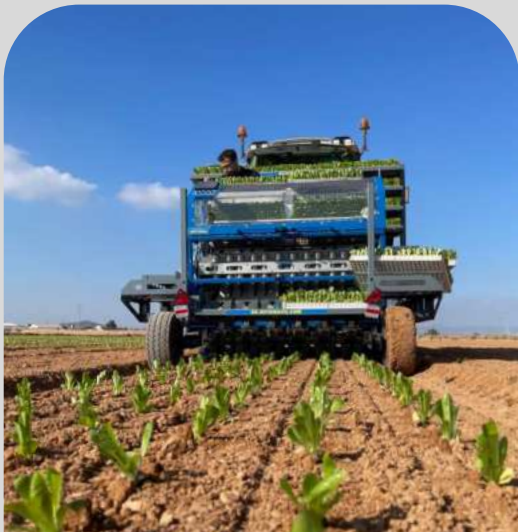
6-line also available in self-propelled