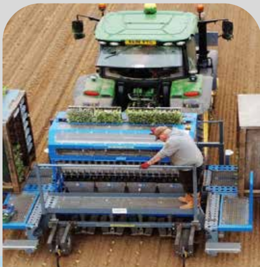
4-line 20000 plants per hour