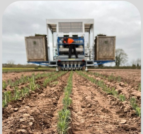
Forestry tree planting 5-line one robot