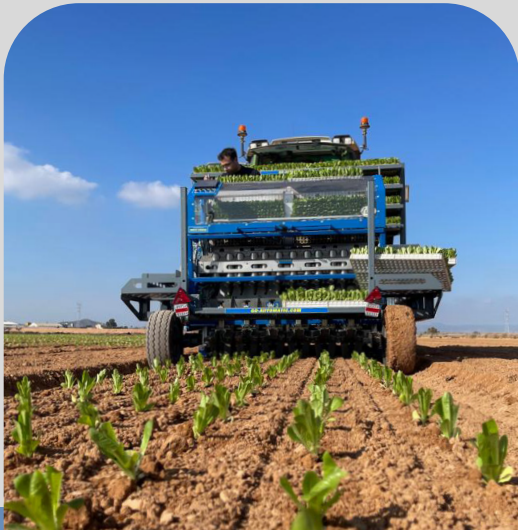
6-line also available in self-propelled