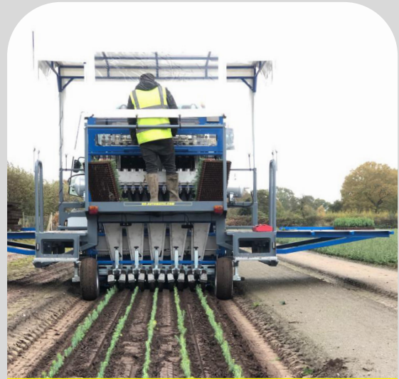
Forestry tree planting 5-line one robot